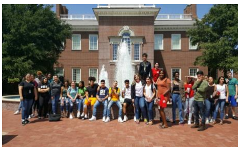
12 th Grade DBU Campus Visit