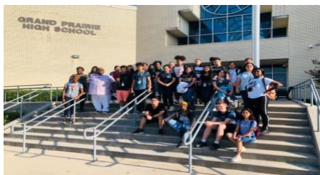
12 th Grade SMU Campus Visit