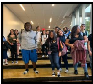
11 th Grade MVC Orientation

There will be school-wide TSI Testing for Reading, Writing, and Math. Students must test this day to be eligible for SPRING COLLEGE REGISTRATION. Otherwise, they will have to test at Mountain View College. There is a MATH website below for students taking the MATH TSI. This website can also assist with any dual credit math class. Have your student check it out.